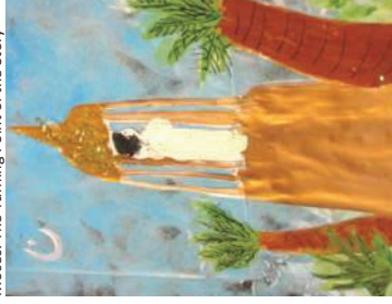
Bilal and the Call to Prayer