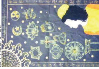
Where is God?

Images from www.natre.org.uk/spiritedarts/ Why not enter your pupils this year?