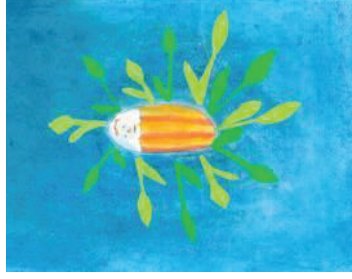
Moses: The Turning Point of the Story